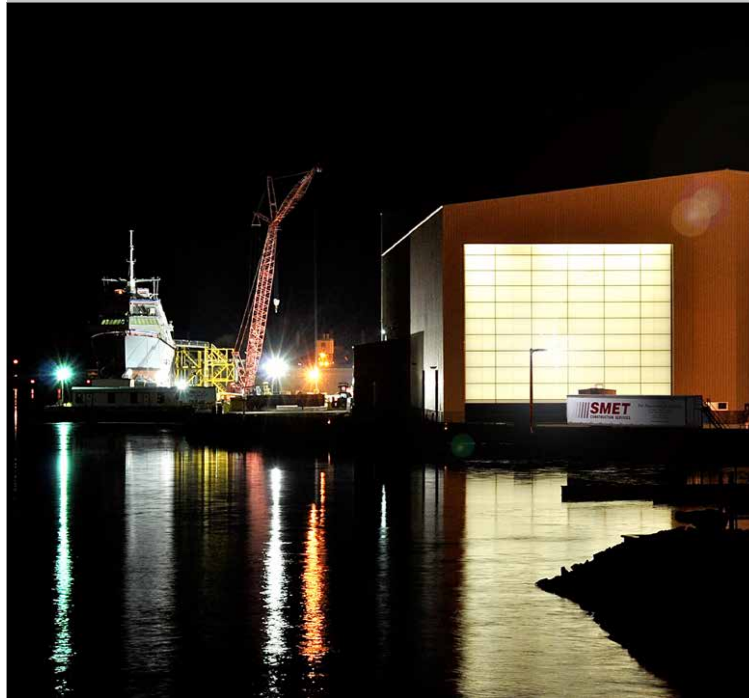
© ASSA ABLOY Entrance Systems AB BR:SHI|ORGEN-1171406 Technical data subject to change without notice.